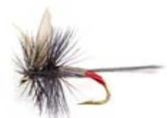
Iron Blue Dun

Lunn's Particular size 16 Iron Blue Dun 16 Sawyers Pheasant Tail Nymph 16